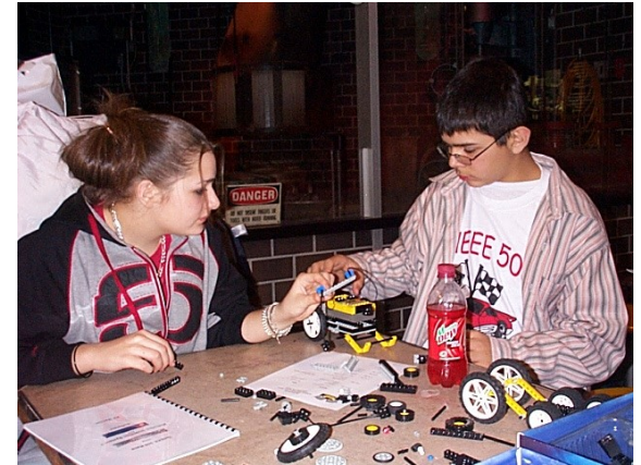
Kids Learn EE Hands-on at Community Outreach Event