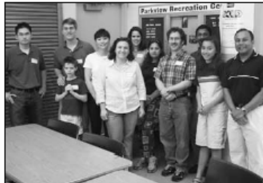
About a dozen volunteers turned out at the Parkview Recreation Center in July to make the GOLD-sponsored outreach event a success.