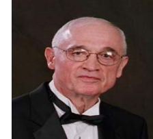
R4 - Nick Holonyak, Jr. 2003 Medal of Honor