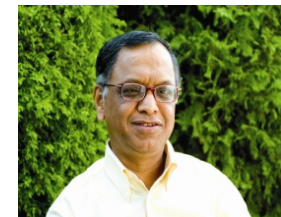
R10 – Narayana N.R. Murthy 2007 Engineering Leadership