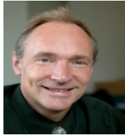
R1 - Timothy Berners-Lee 2008 Maxwell Medal